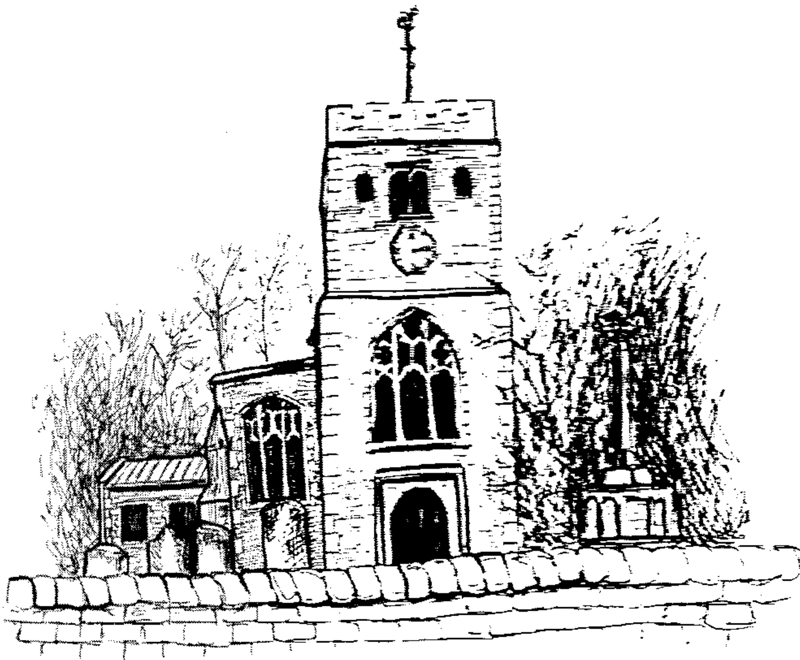
St Mary the Virgin, Denham Village