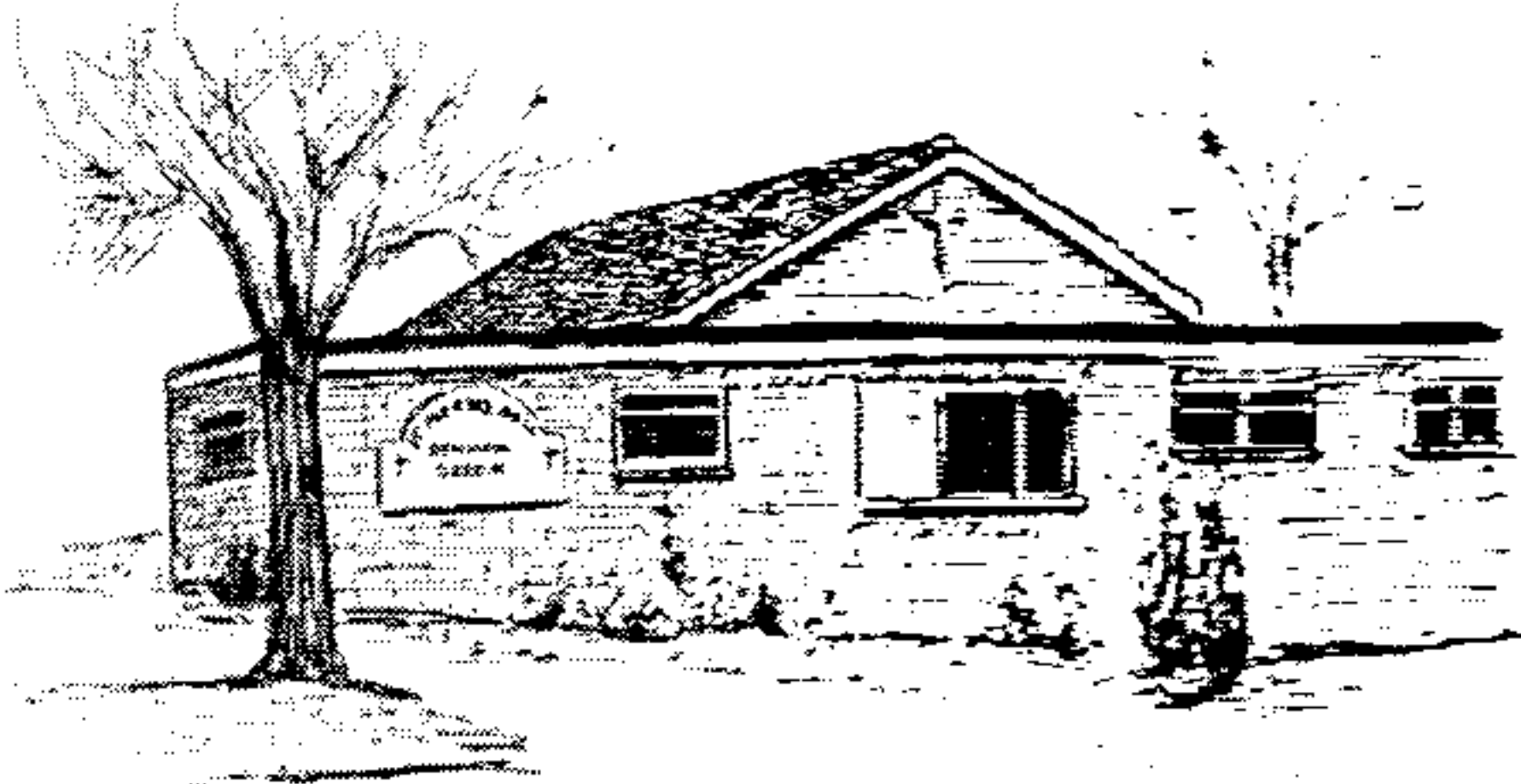
St Marks, Denham Green