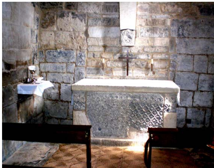
Carved stones found nearby have been made into an Altar at the church of St Laurence, Bradford-on-Avon. Fragments of a cross have been set above it.

are currently in an interregnum. A new priest has been appointed and will join them shortly.